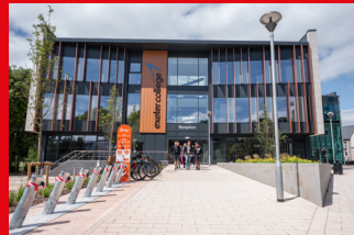
Digital and Data Centre