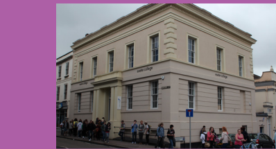
Centre for Music Performance