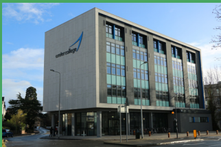
Maths and Science Centre