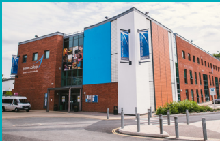
Centre for Creative Industries